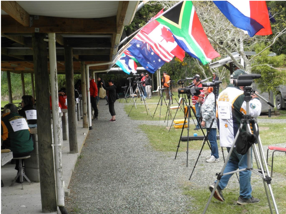
Flags and competitors at shooting station.

United States wins most, but Australia takes the big one