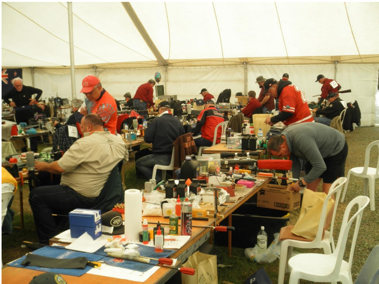
Inside the loading marque

. http://bulletin accurateshooter.com/2017/11/world-benchrest-shooting-championship-in-new-zealand/