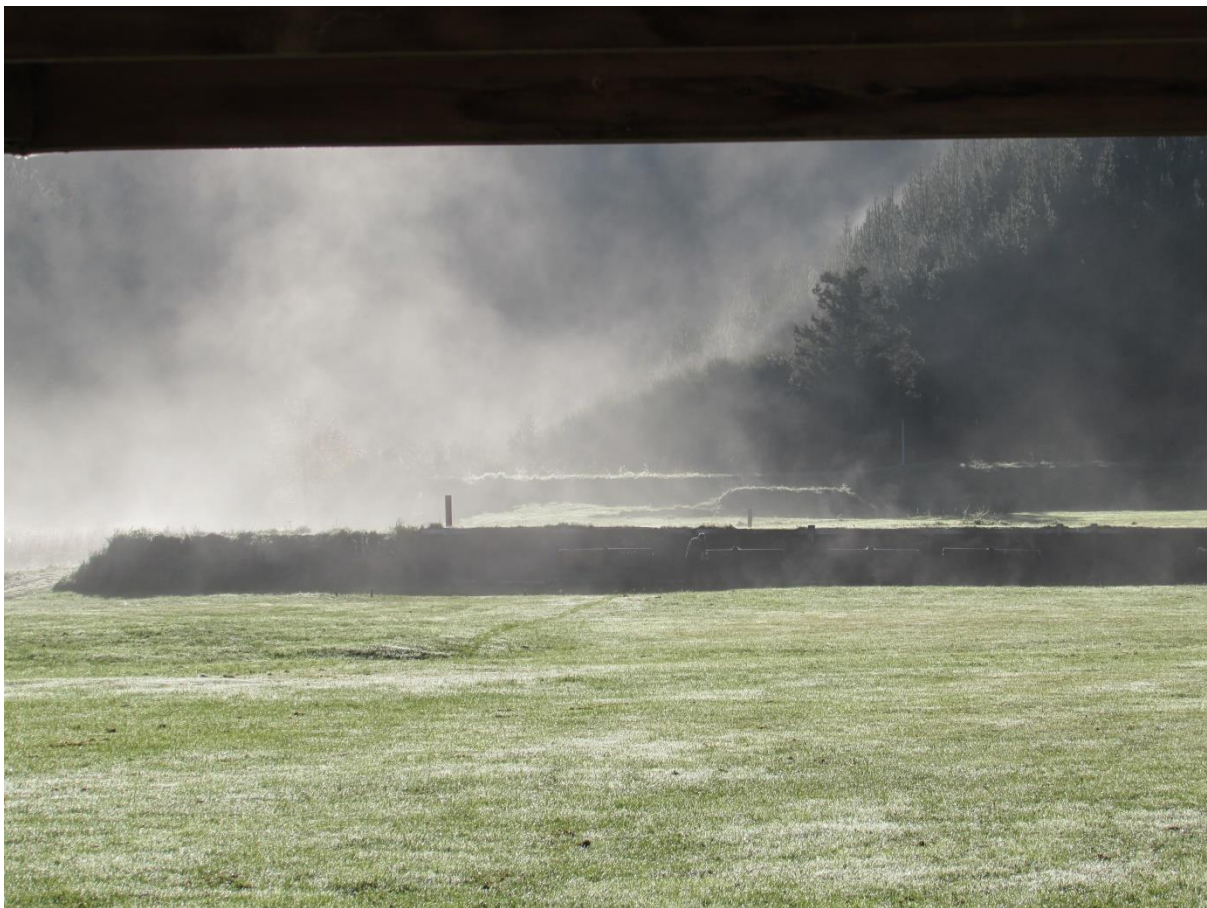
Figure 1: Person in dark green clothing at 100m stop affixing target at about 0930 hours. He is virtually invisible but in centre of picture.

The photos below were taken at the range recently, all from the firing line. The first two (Figures 1 and 2) were not staged in any way. It was people going about their usual. It is both amazing and concerning how invisible a person can be at even 100m in certain light conditions. These pictures were taken just as the range opened at about 0915 hrs.