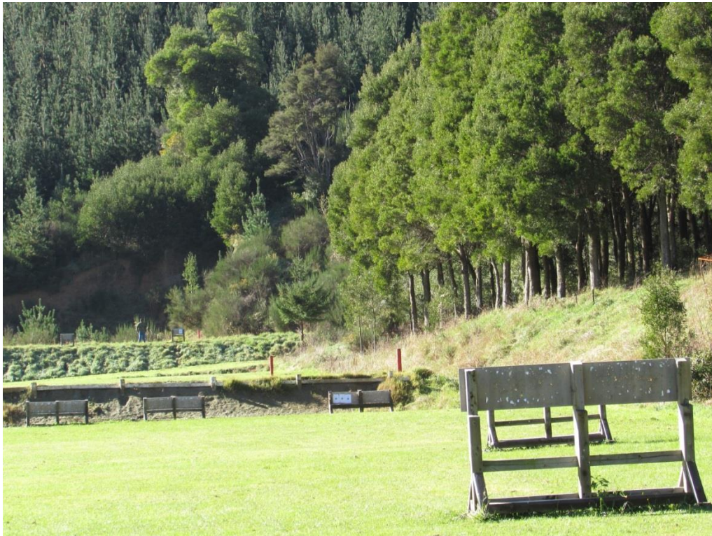
Figure 3: Person in jeans and camo top at 200m mark at noon in bright light

The second two pictures (Figures 3 and 4 below) are staged. The ‘model was asked to stand at the 200m stop and wear camo jacket and Hi-Viz orange road worker type vest for comparison. These pictures were taken around noon when it was much lighter and brighter. The difference is plain and it is clear that the clothing that blends into the background the most is dark and green or camo.