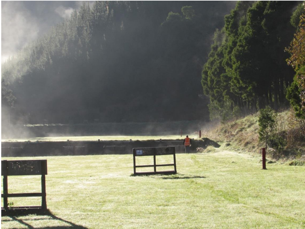
Figure 2: Person at 100m stop at same time as Figure 1 above.

The second two pictures (Figures 3 and 4 below) are staged. The ‘model was asked to stand at the 200m stop and wear camo jacket and Hi-Viz orange road worker type vest for comparison. These pictures were taken around noon when it was much lighter and brighter. The difference is plain and it is clear that the clothing that blends into the background the most is dark and green or camo.