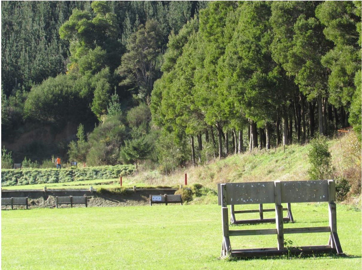
Figure 4: Person in jeans and Hi-Viz orange vest at 200m mark at noon in bright light

Hi-Viz vests are NOT expensive! All our local safety stores sell them from around $10-20